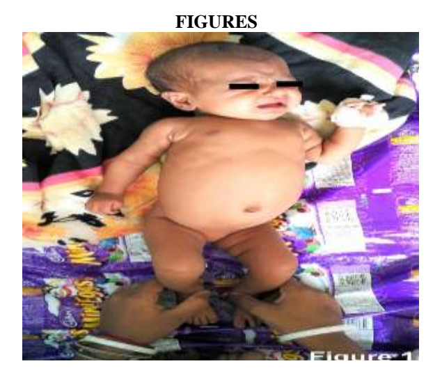
Figure 1. Baby on admission, irritable and inconsolable cry

Demonstration of placental parasitemiais gold standard for diagnosing congenital malaria and is possible only when mother is antenatally diagnosed. [11] Confirmation of diagnosis is normally done by demonstrating the parasite within red corpuscles. Treatment should be initiated as soon as diagnosis is confirmed with schizontocides like chloroquine. For complicated malaria or chloroquine resistant Plasmodium Falciparum malaria, intravenous quinine or artesunate are used. In congenital malaria, as there are no forms that invade the liver, treatment for exoerythrocytic cycle is not needed. [3,7] The global drive for improvement of perinatal outcome has made congenital malaria a relevant public health issue.