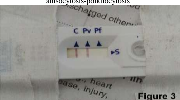
Figure 3. Malaria Kit test showing Plasmodium Vivax positive in baby

Figure 2 . Peripheral blood smear of baby showing schizonts of Plasmodium vivax (arrow) , hypochromia and anisocytosis-poikilocytosis